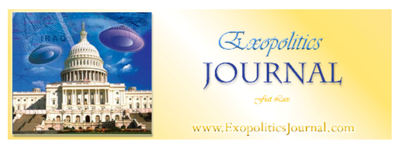
Let's change that Prime directive! The Agony and the Ecstasy of Ufology