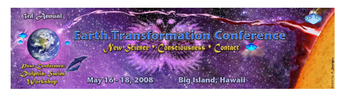
For Conference Information visit: http://www.EarthTransformation.com