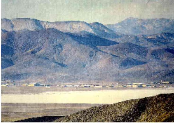
Area 51 – Groom Lake, Nevada

The four chapters of the third section focus on underground installations, with detailed maps of what is where at Wright-Patterson and Los Alamos respectively in the first two. The third chapter looks at the reverse engineering issues arising from specific recovered craft and artifacts as performed primarily underground at Los Alamos. This includes some relatively recently “leaked” top secret information about an “Extraterrestrial Energy Device” and some